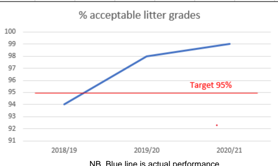
NB. Blue line is actual performance